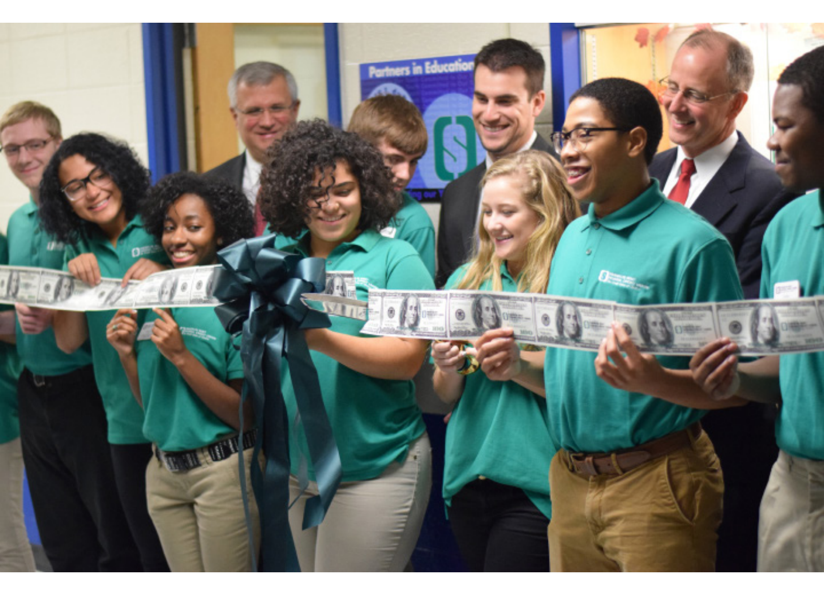
Alexis I. du Pont High School and the Franklin Mint Federal Credit Union launch an on-site Student-Operated Financial Literacy Center, the first of its kind in the state of Delaware.