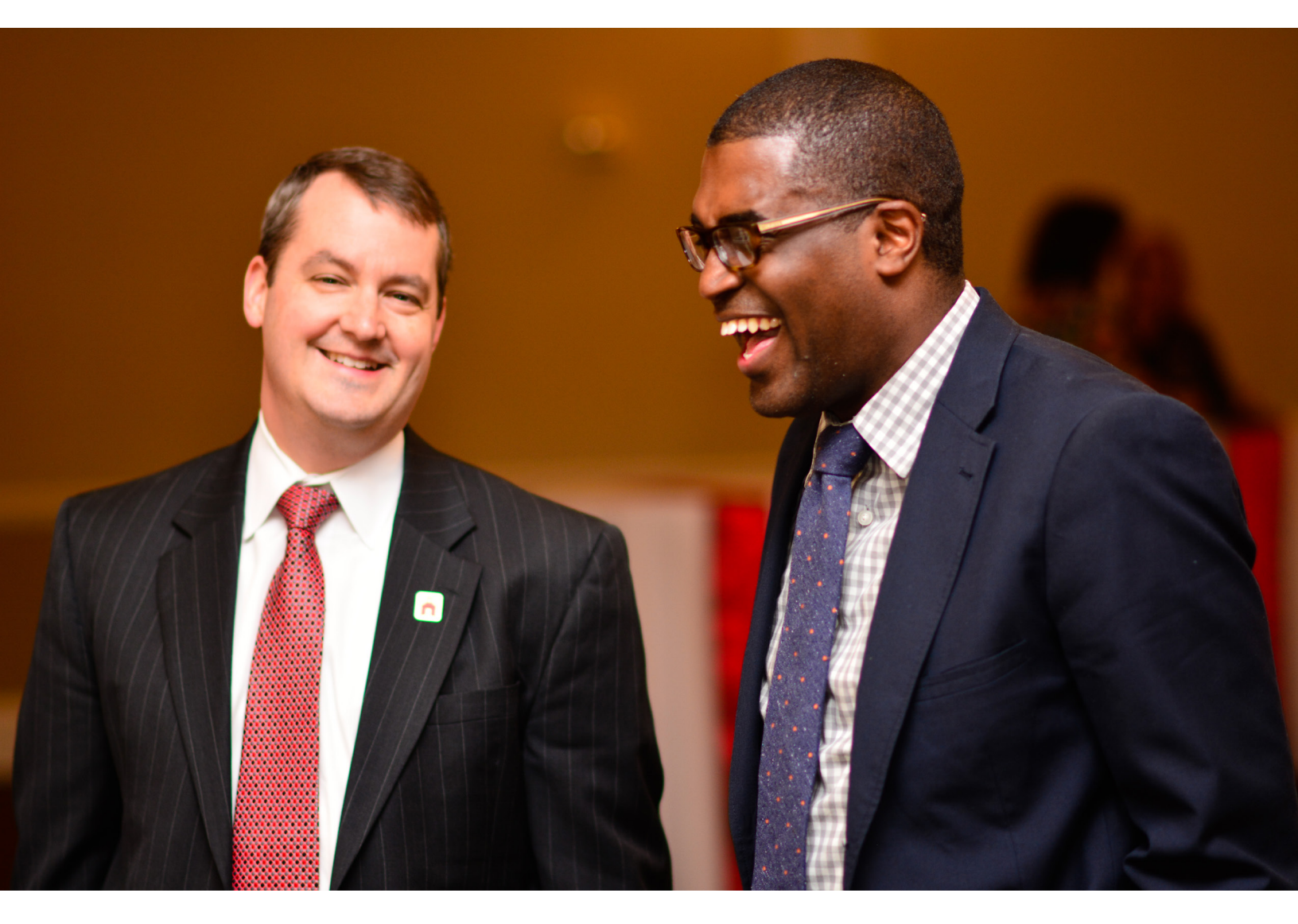
Red Clay friends and community members gather to honor 12 impactful individuals at the district's first annual Hall of Fame Gala.