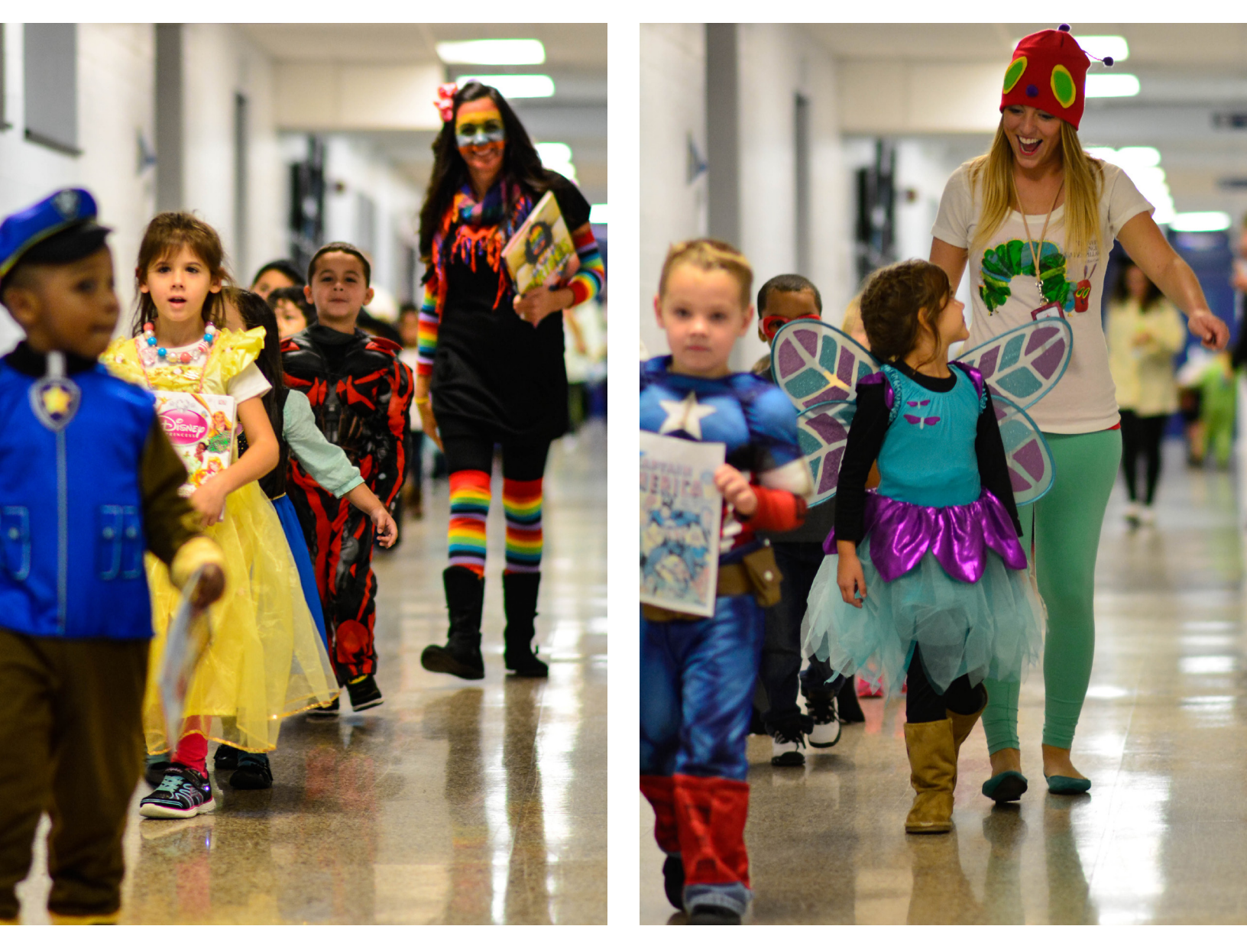
Baltz Elementary School students and teachers dress up as their favorite characters and treat district office employees to a mid-day costume parade.